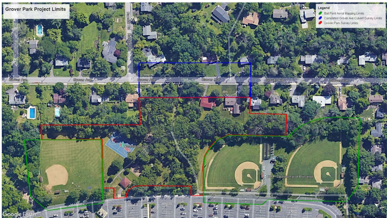
Figure 1 – Limits of Survey and Aerial Base Mapping

During field survey, any wetlands areas within 150 feet of the proposed park improvement project area will be located and delineated, marked with flags, and mapped as delineated and referenced to the survey base map. The current resource value classification of the wetlands will be determined according to the three categories (exceptional, intermediate, ordinary) set forth in the New Jersey Freshwater Wetlands Preservation Act.